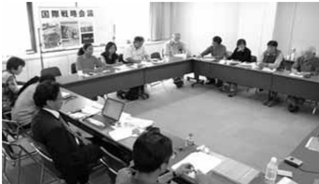
A view of the symposium held in Tokyo. Delegates from Japan, Guam, and South Korea visible

From October 20 to 28, I was a guest of the Peace Forum, a section of a larger group called Gensuiken. During this time I was able to participate in and speak at a number of peace and anti-bases actions in Tokyo and Okinawa. The principal event was the International Anti-War and Anti-Base Meeting which had delegates South Korea, Guam, Philippines, Japan and Australia.