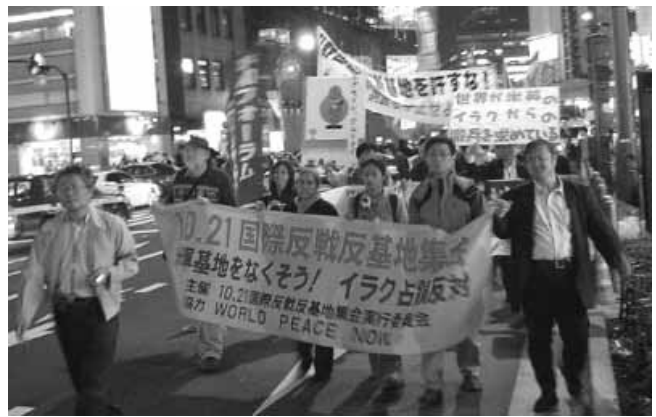
The lead banner in a rally to end the Iraq in Tokyo 21st Oct with delegates from all the region holding the banner. This rally was held at peak hour around 6 pm in the centre of Tokyo.